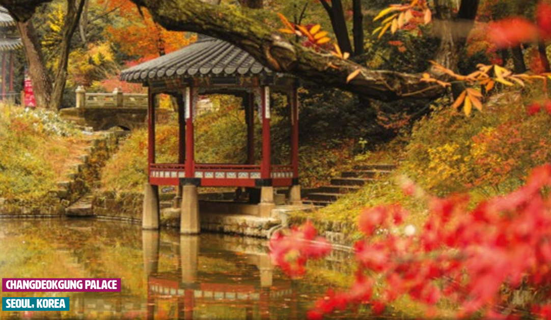
CHANGDEOKGUNG PALACE SEOUL, KOREA